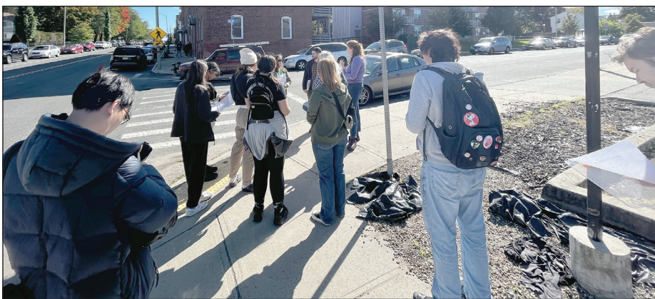
Students from Holyoke Community College and Smith College worked to help measure trees for the long-term urban forest study beginning in Holyoke.