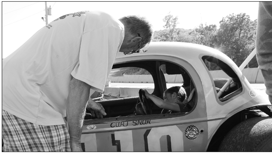
A young car enthusiast takes a turn behind the wheel of a car entered by Two Flakes Racing.